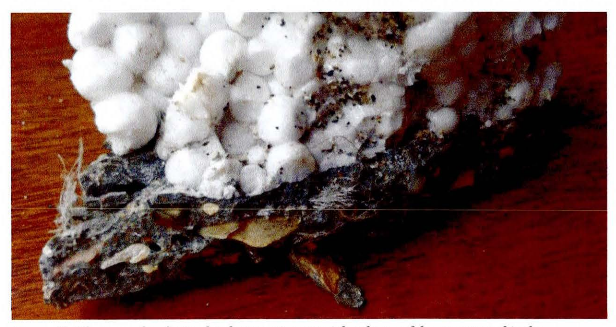
Figure 11: Illustrates the plastic shard composite material make-up of the cement used in the pontoon.

On studying a crumbled sample (Fig. 11) extracted from the pontoon, the cement layer is embedded with plastic fibre shards (a common aggregate in cement). Swift recovery of such eroding materials is key and we will continue our demand to have this pontoon removed, it won't be an easy task breaking up the pontoon and ferrying its load back to Howth Harbour, but we have many volunteers keen to help. We have repeatedly offered help and man power to Ireland's Eye Ferries for the removal of this pontoon since 2018 but unfortunately to no avail. There is hope still, working together with Clean Coasts, Fingal County Council, Tetrach and Ireland's Eye Ferries we hope to be able to break apart this plastic leaching wreck and take it back to the mainland for disposal.