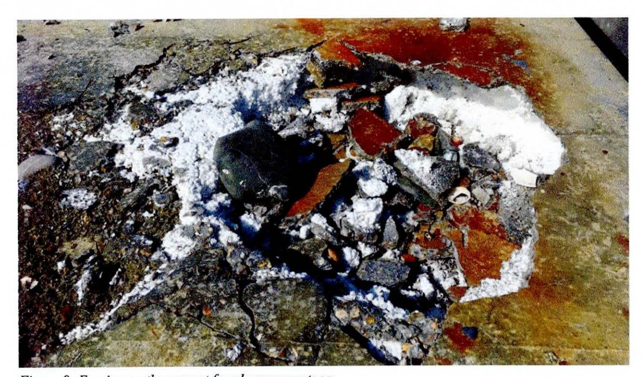
Figure 9: Erosion on the cement faced upper pontoon

Most devastatingly the wrecked pontoon was still washed ashore on Carraigeen Bay and it's polystyrene core had eroded significantly since 2018. We found much polystyrene balls scattered among the Carraigeen Bay sand, marram grass, and disturbingly in burrowed nests. These nests could have been rat or puffin nests so we couldn't disturb them, however the level of white plastic puffs, which had been dragged into hollowed nests made for a grim sight.