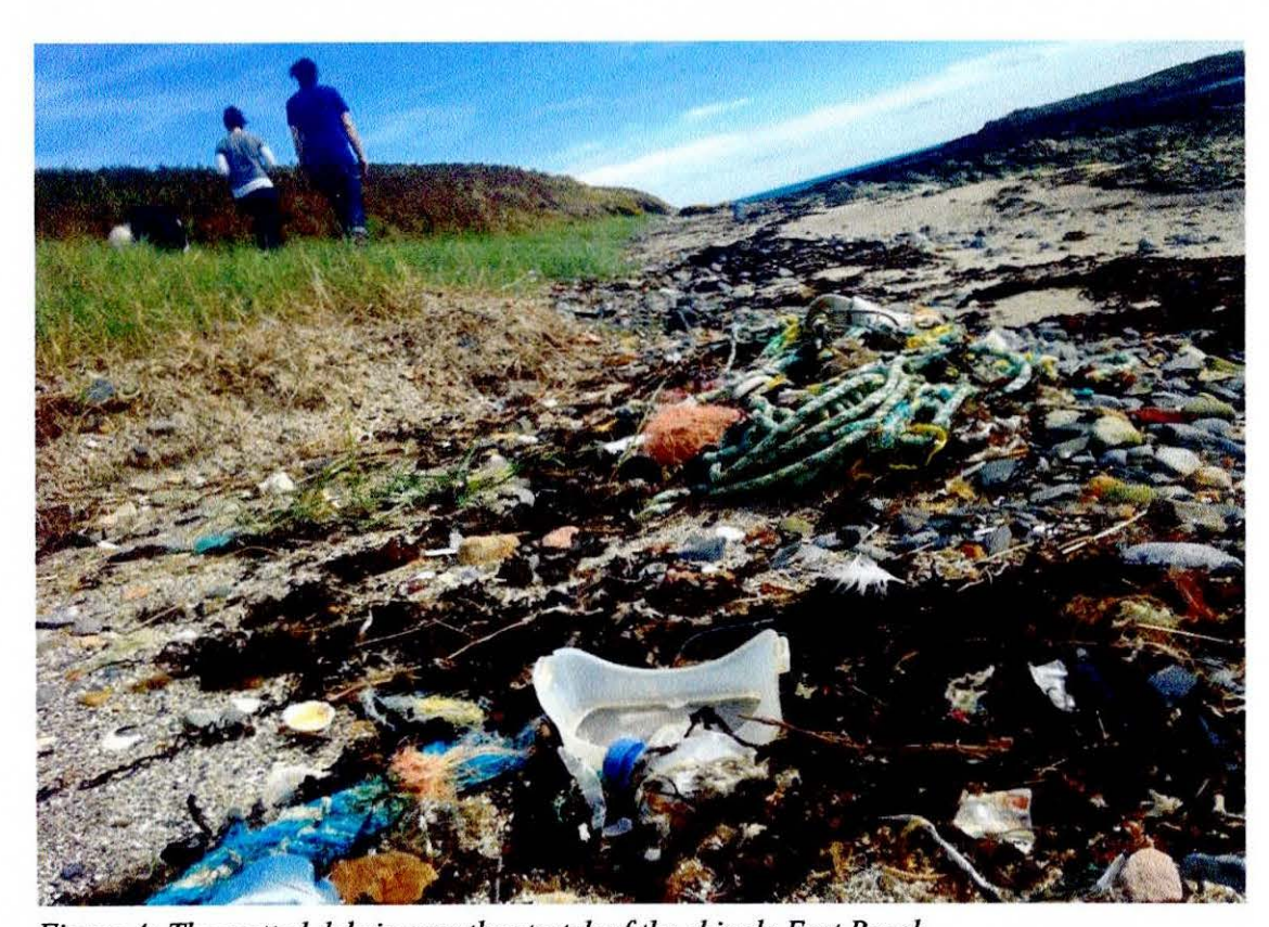
Figure 4: The matted debris runs the stretch of the shingle East Beach.

The wrecked pontoon washed ashore on Carraigeen Bay was eroded and leaching significant polystyrene debris along the shore (Fig. 5). Although it cannot be identified as being from the same source, across the sea on Claremont and Burrow beach, there is a spread of polystyrene debris matted into the marram grass dunes.