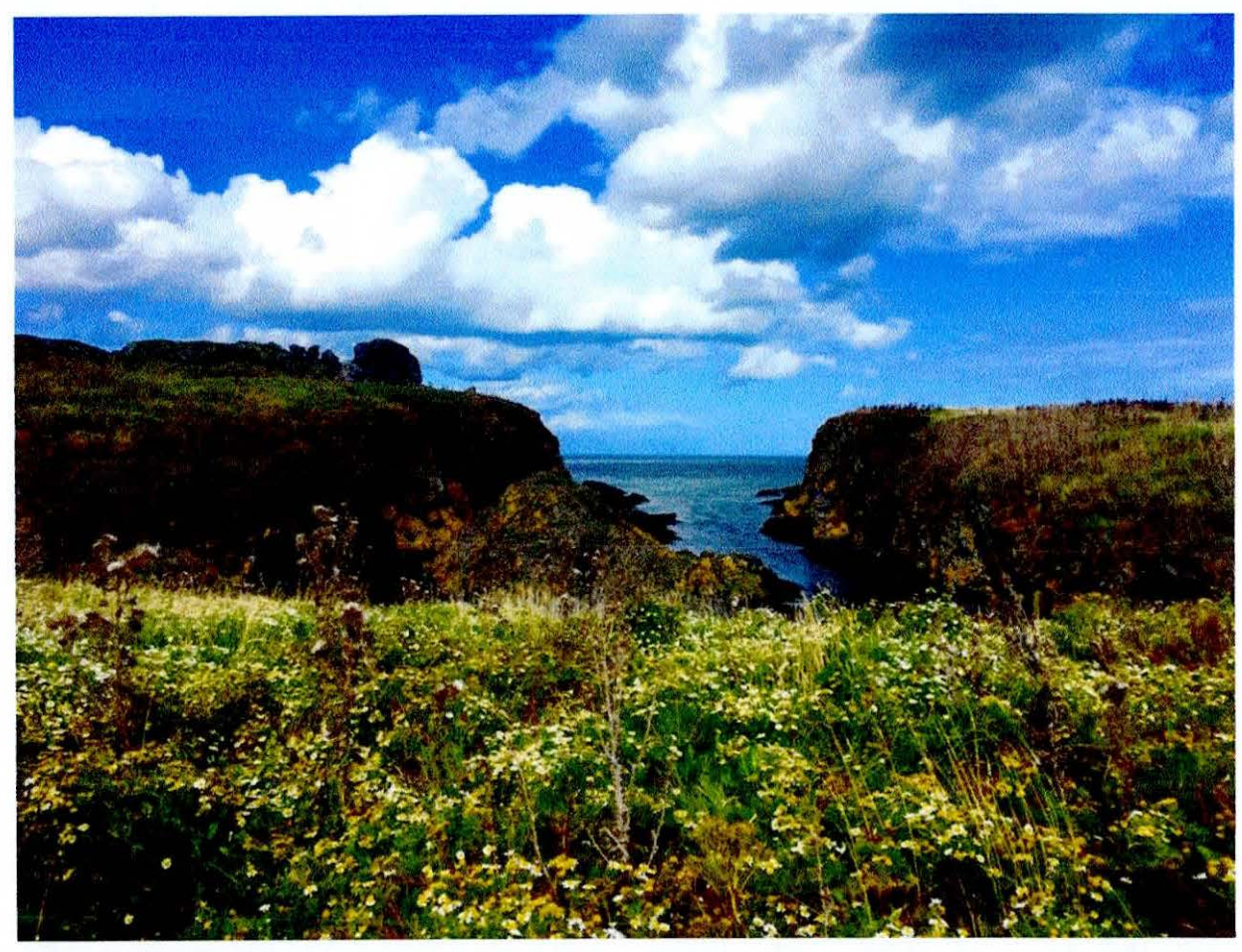
Figure 7: The inland grassy meadow up from the West Beach.