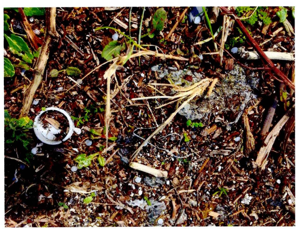
Figure 6: Nurdles matted into the inland grassy meadow up from the West Beach.

Our findings from the clean-up were that Carraigeen Bay and the shingle beach on the west of the island was quite littered with marine debris but on a positive note the pollution was greatly reduced compared to the same time last year. Much of the pollution found was fishing equipment such as ropes, net and tackle. The second most common finding was sanitary waste including tampons, tampon packaging, sanitary towels and cleansing wipes. There were also findings of recreational litter such as beach toys, inflatables and BBQs.