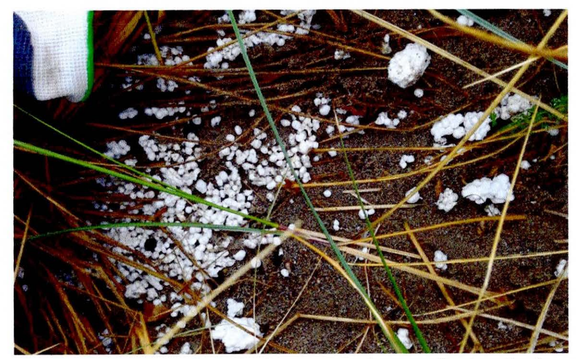
Figure 4: Polystyrene gathered matted in the marram grass burrows at Carraigeen Beach.