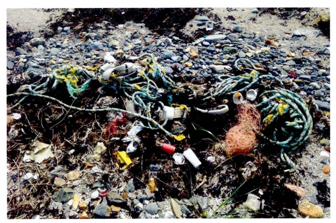
Figure 3: Accumulation of debris