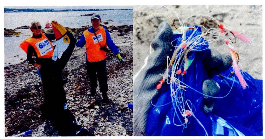
Figure 5: Findings of recreational litter and fishing tackle.

20 volunteers took part in a day of events including ridding Carraigeen Bay and the East Beach of 15 full bags of debris during a 40-minute clean-up, which we estimated as 100 kg in weight. Key speakers from CHERISH (Climate, Heritage and Environments of Reefs, Islands and Headlands) gave talks on archaeology, geology and the impact that increased storminess and climate change is having on our treasured coastal heritage.