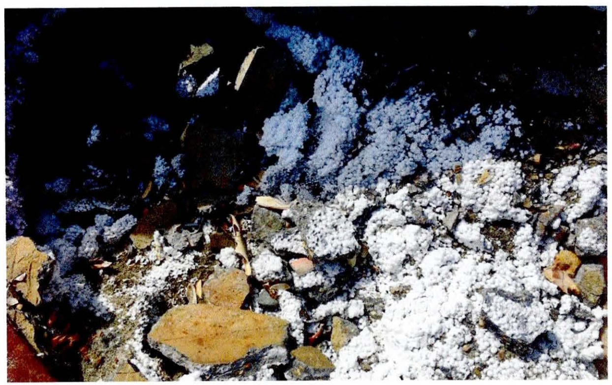
Figure 10: Eroded polystyrene core and exposed base of the pontoon